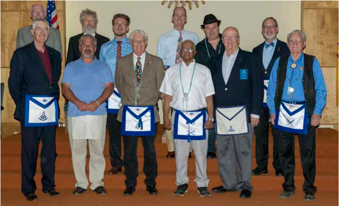
Brethren present for the Annual Step Up Night communication, Monday, October 1, 2018.